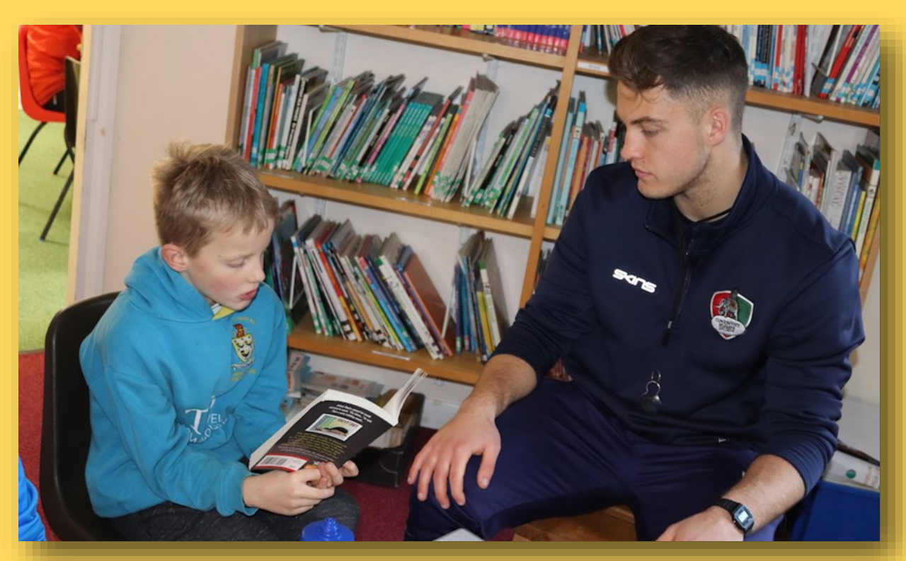
Pic: Charter Savings Bank, article courtesy of Chris Wearmouth

When you're on the pitch, defending a narrow lead with only seconds remaining on the clock – reading the play and what is in front of you becomes vitally important. Reading what the opposition team might do, where their fly half might be kicking the ball and what the next few phases of play might produce. Reading is crucial on the pitch, but that is nothing to its level of importance off it.