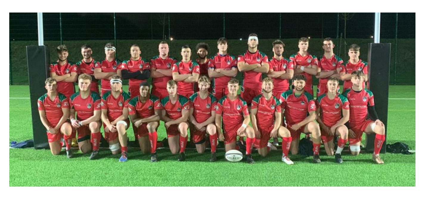
Game 1 at the DeMontfort University Sports Ground, Bennion Road, Leicester on 26th Jan, where Coventry Under 18's overcame their Brooksby Melton College opponents by 26-19.