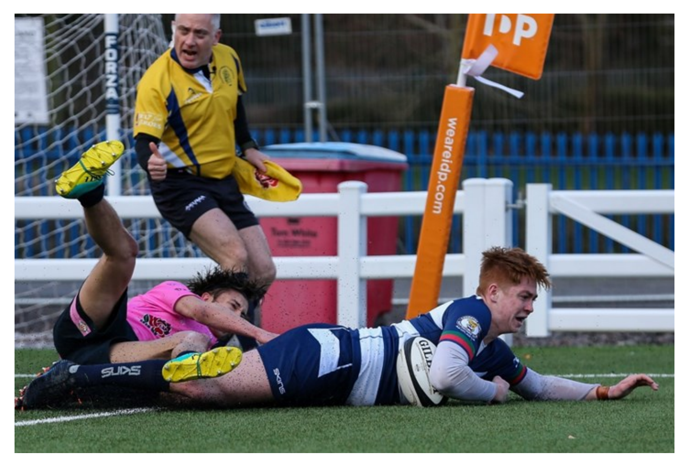
Game 2 The Coventry Under-18s had a winning home fixture on 23rd Feb, beating the Independent School Lambs 17-5 at Butts Park.